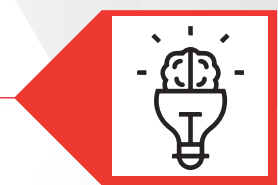
Idea Speak Business Pitch and Feedback