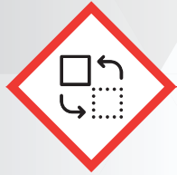
Product Transformation Workshop