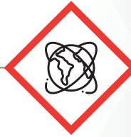
Global Rights Trading Interactive Session