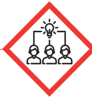
Idea Spark Group Exercise