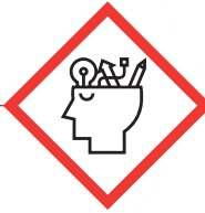
Understanding IP Workshop