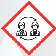
Know your Customer Workshop